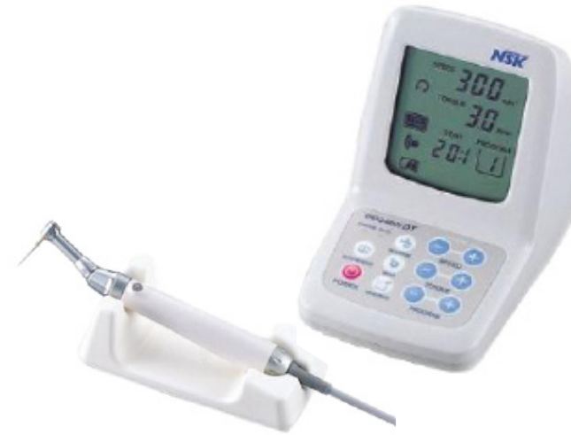
EndoMate DT NSK