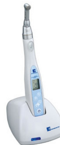
EndoSequence II Brassler