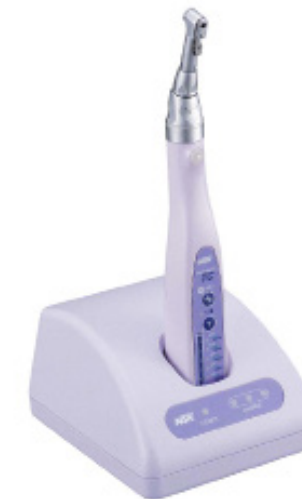
EndoMate TC NSK