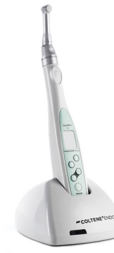
CanalPro CL ColteneEndo