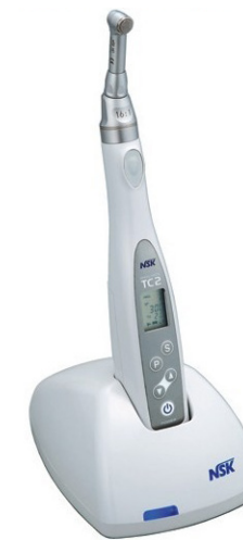
EndoMate TC2 NSK